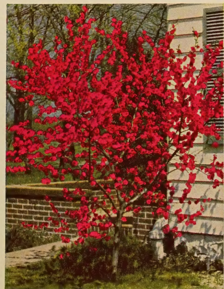
Double Flowering Peach

CATALPA SPECIOSA. Fast grower. Useful where quick effect is desired. 6-8 ft., $3.50 each. 8-10 ft., $4.00 each.